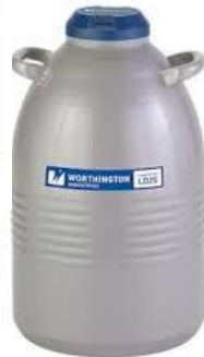
Liquid Nitrogen Tank