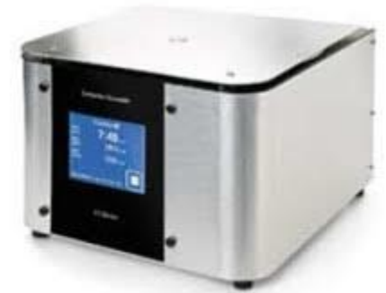
High speed cooling centrifuge