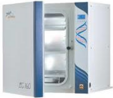
Carbon Dioxide Incubator