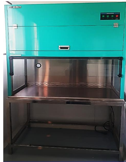
Laminar flow hood