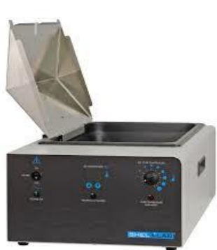
Shaking Water Bath