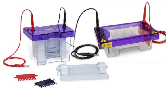
Vertical & Horizontal Electrophoresis