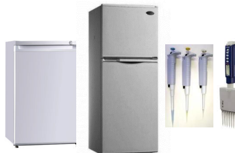
Deep freezer -20 & Refrigerator & Micropipettes