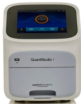
QuantStudio™ 1 Real-time