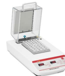
Dry Block Heater