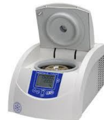
Sigma Small Cooling Centrifuge