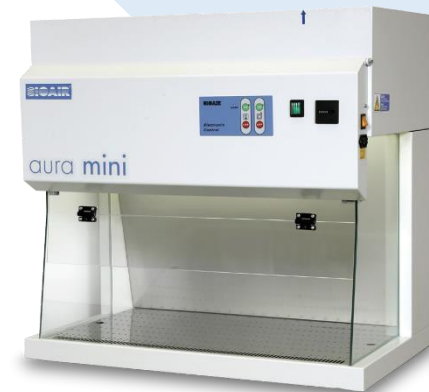
Laminar Flow Cabinet